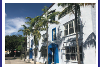
4. Project: Cocovana Condominium Location: Miami, FL 3 Story Building

1. Leamington Hotel: Perform construction management, inspection control and forensic inspection for the 36,000-sf building during the repair phase in order to provide a 40-year certification.