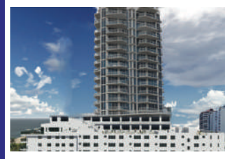
3. Project: Mimosa Hotel & Spa Location: Miami Beach, FL 9 Story Commercial Building