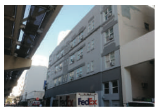
1. Project: Leamington Hotel Location: Miami, FL Over 80 Rooms

Our construction managers have participated in several projects for both the public and private sector. As construction managers, we have provided services such as: contract negotiation, bidding support, quality control coordination, project meetings with contractors, inspections during the construction, document control for submittals and shop drawings. Listed below are examples of projects we have performed construction management services on: