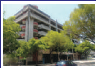
1. Project: Hickman Garage Location: Miami, FL Over 1,000 Parking spaces

Our team has also handled damaged control joint sealants, parapet joints, concrete curb joints, caulk light poles, railings pickets and HVAC unit bases among other incidental work needed to provide proper waterproofing to the building. Below are some of our completed projects where structural restoration services were performed.